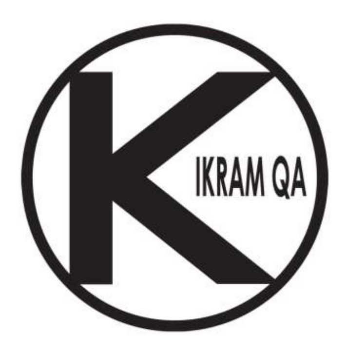
Figure 1: K-MARK logo

IKRAM QA reserves the rights to amend this document whenever deemed necessary.